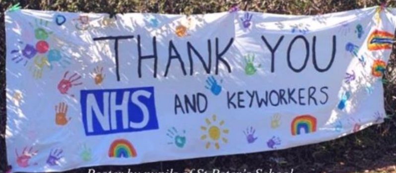
Poster by pupils of St Peter's School